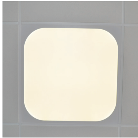
Frame for light opening with rounded edges