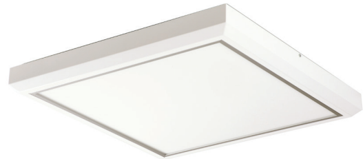
Aura Apus LED surface mounting box.